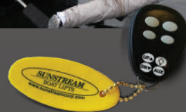
Remote control standard with all FloatLift™ models.